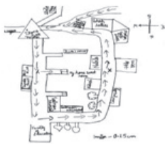
Map I (age 13 yrs)