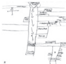
Map II (age 10 yrs)