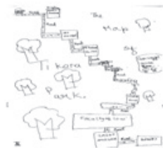
Map III (age 8 yrs)

locality showing locations in a linear arrangement (Map II and III), though the actual road formed a closed loop. When asked, on site, why they made a road that kept going up the page, they confidently explained that while walking on that path they always went ahead and never turned back! The experience of walking on the road shaped the map they made, without their being able to imagine it from an aerial perspective. It was a 13 year old girl in the locality who drew a closed loop for the road (Map I) though the orientation and scale of her map was still impressionistic and very different from that of the cartographer.