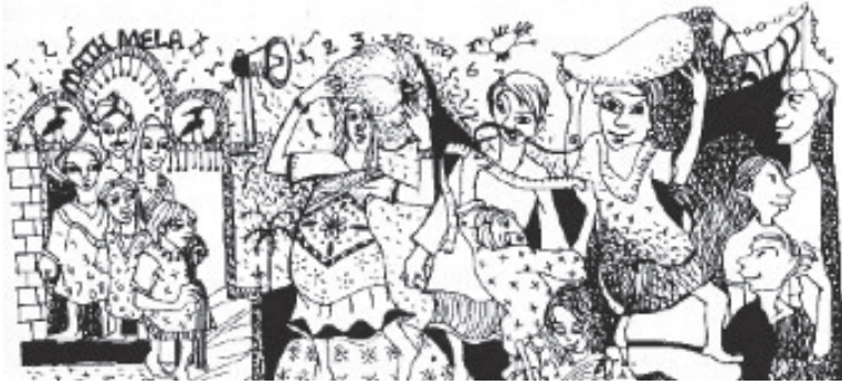
Figure 1: Festival goers.

Even as you join the queue, you ask why “metric” mela , but receive no clear response. The volunteers, young girls themselves, giggle a bit and are mysterious—you’ll find out soon. .... Even as you move along, you are intrigued by your red card, and you take a look at it. It has a big table with each row having a description and some blank entries. Passing over routine items like height, weight etc. you are intrigued by entries like “weight of a feather?”, “length of lauki ( gourd )” etc. Wait a minute, what is that—“length of nose”?! They are not going to measure the length of your nose, are they!?